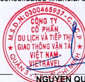
NGUYEN QUOC KY